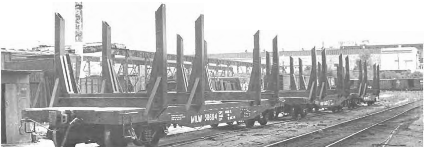
The painted, stenciled high stake log flats are ready for service on the Milwaukee Road.

This photo essay not only shows the magnitude of the work involved in such an operation, but also illustrates that special brand of ingenuity and skill found throughout the Milwaukee Road.