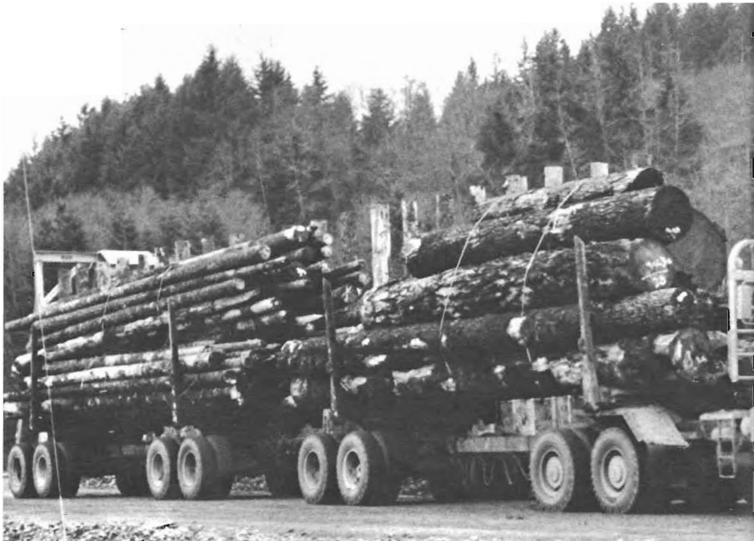
An oversized load of logs (above) comes off a private road from Weyerhaeuser's tree farm, the logs are sorted into bunkers (top right) that are the same size as a log flat and then loaded (bottom right) onto flat cars.

The unit log trains will operate from originating terminals at Mineral, Morton, National and Skookumchuck, and from South Chehalis and Curtis on the Curtis, Milbourn & Eastern Railroad. The C. M. & E. R. is an 11-mile subsidiary of Weyerhaeuser which connects with the Milwaukee Road at Chehalis. The trains will deliver the logs to Tacoma, Cosmopolis and Skookumchuck.