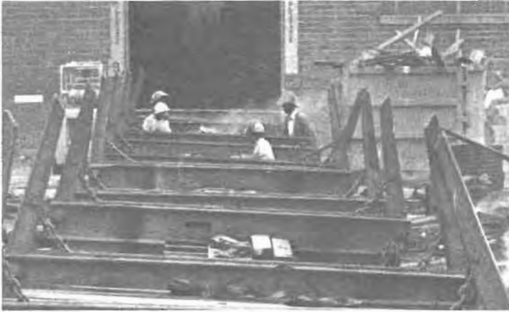
1. Old spring stake log flats lined up for stripping may look as if they are ready to be scrapped, but after conversion into high stake flats will serve the Milwaukee Road for many more years.