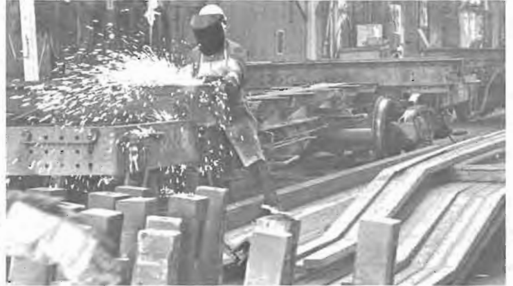
2. Inside the shop, draft gears and couplers are removed and the cars straightened and trimmed. At the same time, fishbelly sides are made to be attached later in the assembly line.

From not much more than scrap on wheels, some 200 old spring stake log flats were converted recently into specially designed high stake cars for the WAM (Weyerhaeuser and Milwaukee) Plan. Another 300 high stake flats are scheduled for production and will be used to serve other log shipping customers such as St. Regis, Diamond-International and Potlatch.