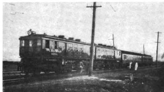
Fig. 3. The Locomotive on a Trip from Butte to Durant and Return on the B., A. & P. Rwy. with the C., M. & St. P. President's Special

exceeded the expectations of the designers. Tests made on the regenerative braking equipment were especially gratifying to the engineers and the hauling capacity of the locomotives was demonstrated to the satisfaction of all concerned.