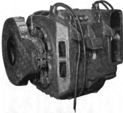
Fig. 8. One of the Eight, 430-h.p., 3000-volt Motors Used for Driving a C., M. & St. P. Locomotive

brakes are thus used only for emergency service or in making the final stop. Regeneration is controlled by the engineer through an auxiliary handle on the master controller which causes the motors to return power to the trolley in the proper amount to maintain