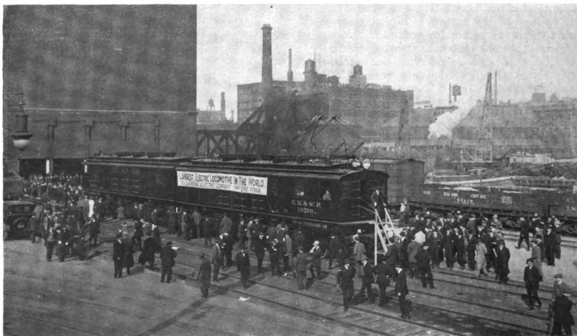
Fig. 6. Another View of the Locomotive while on Exhibition near the Union Station, Chicago