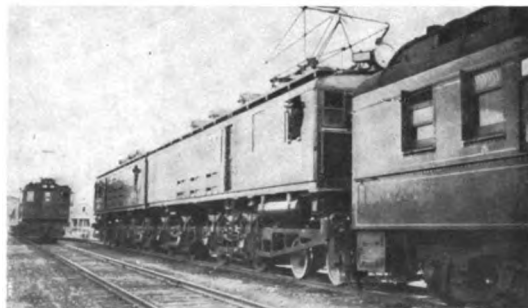
Fig. 4. The Locomotive and Train on the B., A. & P. Rwy. at Silver Bow

On account of the very general interest in the new locomotive the officials of the railway conceived the plan of making an exhibition tour in order to explain the various novel features to both the engineering fraternity and the general public. In all cities where an exhibit was planned a three column advertisement was inserted in the local papers for a week or ten days prior to the date of exhibi-