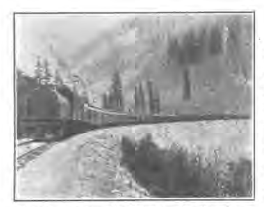
Electric Locomotive Pulling Train Over the Cascades

tinuous electrified line of more than 800 miles. A great advantage which the St. Paul enjoys from electrification is on the mountain grades which are long and heavy. Economies on this account are varied and numerous.