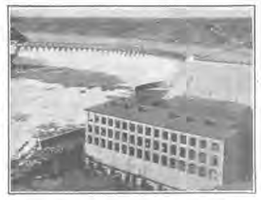
Where Water Power is Turned Into Electricity for the St. Paul Road

From the foregoing it is evident that the turning point in the affairs of St. Paul has already been reached. Results so far this year indicate that the road will do better that it has in the past few years. For many months there has been long-pull accumulation of both preferred and common stocks and these issues will probably commence to give a good account of themselves as soon as earnings figures indicate further financial progress.